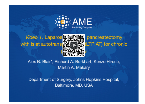
Figure 3 Laparoscopic total pancreatectomy with islet autotransplantation (LTPIAT) for chronic pancreatitis (14). Available online: http://www.asvide.com/articles/1047

floor the following morning. Limited sips and chips diet is often initiated post operatively day 1 with slow advancement towards a goal diet of carbohydrate-limited regular food over the first week. Insulin requirements are aggressively managed over the first few days as the diet is advanced. An extensive education program, started preoperatively, is continued during the patient's hospital stay. Typically, patients require supplemental insulin injections for approximately one-month postoperatively.