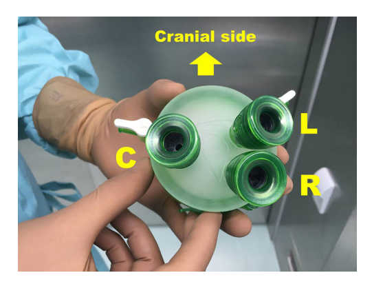
Figure 3 For the GelPOINT Mini, a mini-port can be inserted regardless of the location of the platform. We inserted a port for the camera on the right side of the patient (C), a port for the surgeon's left hand on the left cranial side of the patient (L), and a port for the right hand primarily used by the surgeon for the vessel-sealing device on the left caudal side of the patient (R).

USA) as a gripping forceps, which has an articulating tip for single-port surgery. Prior to performing this surgery, it is important to thoroughly master the skills of bending the forcep tip with the left hand. We use a rigid camera scope 5 mm in diameter with a 30° viewing angle. A camera head that obtains clear images must be used even when using a 5-mm scope.