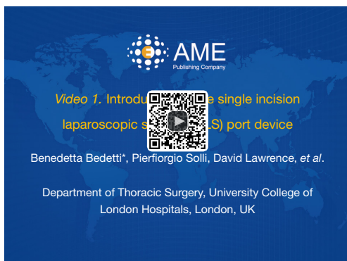
Figure 3 Introduction of the single incision laparoscopic surgery (SILS) port device (9).

Available online: http://www.asvide.com/articles/1121