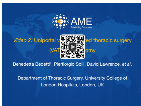
Figure 4 Uniportal video-assisted thoracic surgery (VATS) thymectomy (10).

Available online: http://www.asvide.com/articles/1122