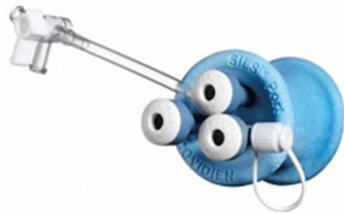
Figure 2 Single incision laparoscopic surgery (SILS) port device.