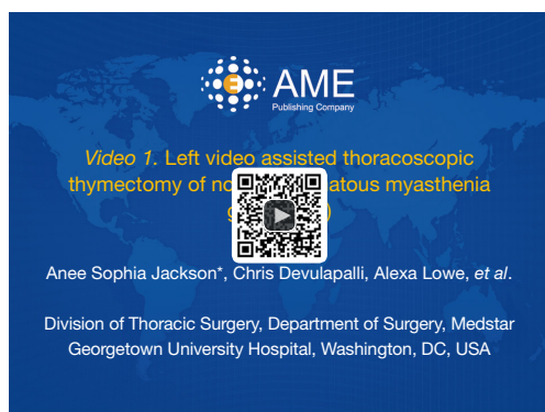
Figure 2 Left video assisted thoracoscopic thymectomy of non-thymomatous myasthenia gravis (MG) (9).

Available online: http://www.asvide.com/articles/1439