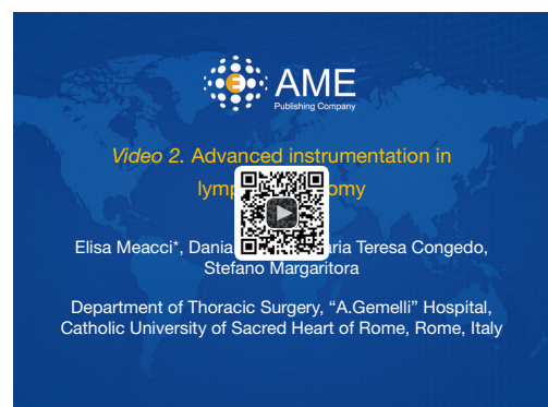
Figure 6 Advanced instrumentation in lymphadenectomy (2). Available online: http://www.asvide.com/articles/1441