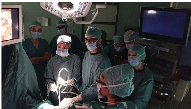
Figure 1 Operating room proctorship during uniportal video-assisted thoracic surgery (VATS) lobectomy at the “A. Gemelli” University Hospital in Rome, October 13, 2016.