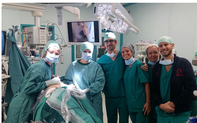
Figure 3 The uniportal video-assisted thoracic surgery (VATS) class at the end of the course.

at the same monitor. The surgical incision (3.5–4.0 cm in length) was created in the fourth or fifth intercostal space at the anterior axillary line. A wound protector was routinely used, and no distraction device was employed to separate the ribs. The specimen was retrieved by a plastic bag through the incision wound. Conventionally, systematic mediastinal lymph node dissection was performed after lobectomy. All patients received intercostal nerve blockade with Ropivacaine and a 28 Fr chest tube was inserted at the end of the procedure. Patients were extubated immediately after the operation in the operating room. Postoperative outcome was uneventful. All patients were discharged in 3 rd postoperative day.