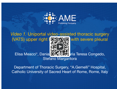
Figure 5 Uniportal video-assisted thoracic surgery (VATS) upper right lobectomy with severe pleural adhesions (1). Available online: http://www.asvide.com/articles/1440