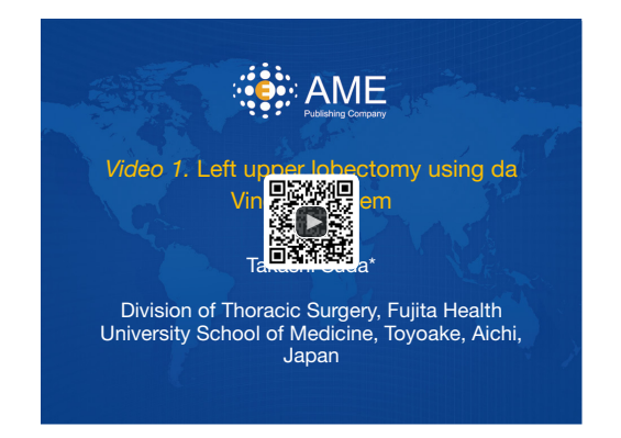
Figure 3 Left upper lobectomy using da Vinci Xi System (2). Available online: http://www.asvide.com/articles/1456

reported that there was a shorter learning curve for robotic surgery than for VATS. Considering that it is impossible to compare the transition of a surgeon who has performed thoracotomies to the first VATS with the transition of a surgeon who has mastered VATS to robotic surgery, it is difficult to compare VATS and robotic surgery. As with thoracotomy, robotic surgery allows a 3D view and also utilizes instruments with joints that mimic the joints of human fingers. Thus, it is expected that robotic surgery should have a shorter learning curve. However, as with VATS, both thoracotomy and robotic surgery involve unique surgical techniques that have to be mastered. On the basis of the available medical literature, a robotic lobectomy has a learning curve that extends over approximately 20 cases for a surgeon who has mastered VATS. However, in cases in which the surgeon has less than adequate experience with VATS, the learning curve will probably be longer.