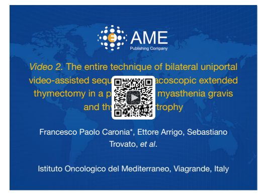
Figure 4 The entire technique of bilateral uniportal video-assisted sequential thoracoscopic extended thymectomy in a patient with myasthenia gravis and thymic hypertrophy (23).

Available online: http://www.asvide.com/articles/1510