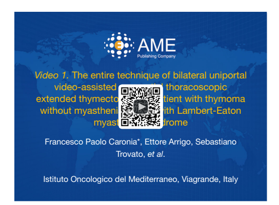
Figure 3 The entire technique of bilateral uniportal video-assisted sequential thoracoscopic extended thymectomy in a patient with thymoma without myasthenia gravis, with Lambert-Eaton myasthenic syndrome (22).

Available online: http://www.asvide.com/articles/1510