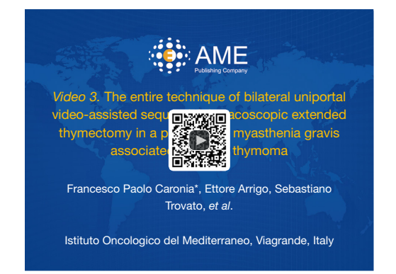
Figure 5 The entire technique of bilateral uniportal video-assisted sequential thoracoscopic extended thymectomy in a patient with myasthenia gravis associated to a little thymoma (24).

Available online: http://www.asvide.com/articles/1511