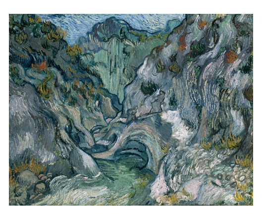
Figure 4 Vincent van Gogh, "The Ravine", 1889.

There is an infinitely variegated pattern of rich and subtle colors, throughout. The transparent water's surface appears to have been painted with bold, closely-placed, well-defined horizontal strokes. Most observers have told me their first impression of this photograph was that it, indeed, was a painting. Compare this to Figure 4 , a painting by van Gogh [1853–1890], similarly characterized by a variegated palette of colors applied in thick layers with rapid, even frenzied,