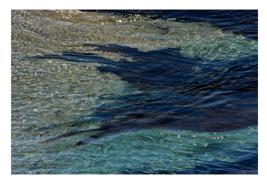
Figure 1 Monet at Sea Lion Cove, Point Lobos, 2013.