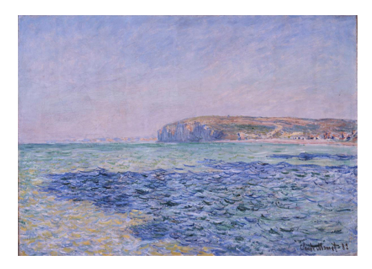
Figure 2 Claude Monet, "Shadows on the Sea. The Cliffs at Pourville", 1882.