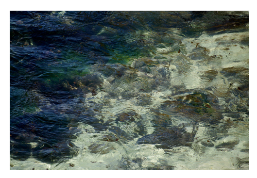
Figure 3 van Gogh at North Plateau Trail Beach, Point Lobos, 2012.

There is an infinitely variegated pattern of rich and subtle colors, throughout. The transparent water's surface appears to have been painted with bold, closely-placed, well-defined horizontal strokes. Most observers have told me their first impression of this photograph was that it, indeed, was a painting. Compare this to Figure 4 , a painting by van Gogh [1853–1890], similarly characterized by a variegated palette of colors applied in thick layers with rapid, even frenzied,