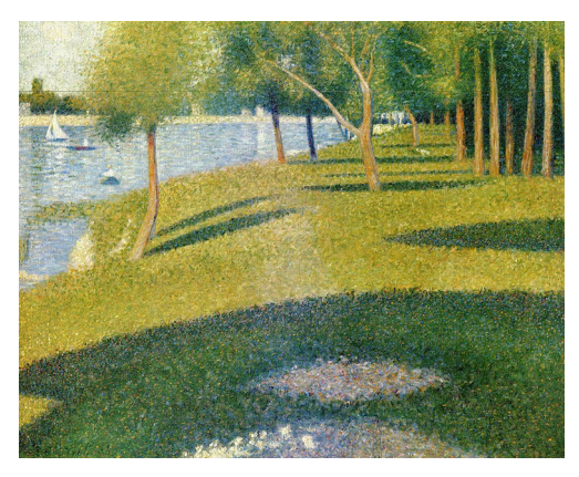
Figure 6 Georges Seurat, "Study for 'A Sunday Afternoon on the Island of La Grande Jatte", 1884.

immediately that Georges Seurat [1859–1891] might have derived his technique of pointillism ( Figure 6 ) from an observation such as this. In Seurat's time, pointillism was Seurat's attempt to develop a technique for art to imitate life. From my current historical perspective, what I saw in the Carmel Valley, as in the previous illustrations, became another instance of life imitating art.