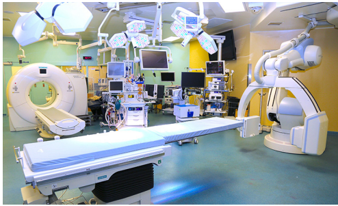
Figure 1 Guided therapeutics (GTx) operation room in Toronto General Hospital. (I) The largest hybrid operating room in Canada; (II) first facility in the world that has a dual source-dual energy computed tomography (CT) scanner (SOMATOM Definition flash, Siemens) and a state-of-the-art robotic cone-beam CT (CBCT)/ fluoroscopy (Artis Zeego, Siemens), within the same OR; (III) equipped with image-based surgical navigation technologies (X-ray and optical navigation; visualization). OR, operating room.

(CT) screening, surgeons are still faced with the difficulties of localization of a small, non-visible, non-palpable pulmonary nodule during video-assisted thoracoscopic surgery (VATS), and robotic-assisted thoracoscopic surgery (RATS). The primary focus of the GTx surgery program is the development of real-time three-dimensional (3D) imaging, and real-time image guided therapy combined with a navigation system, allowing unique therapeutics delivery.