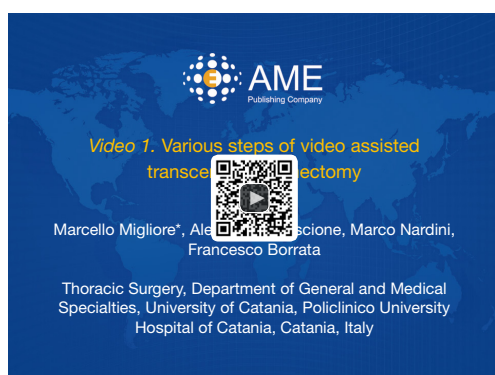
Figure 1 Various steps of video assisted transcervical thymectomy (23). Available online: http://www.asvide.com/articles/1768