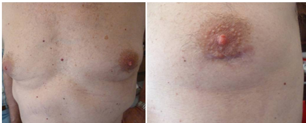
Figure 3 A 1.5-cm additional periareolar access.

eliminates the reported disadvantages. Firstly, because the anterior/superior mediastinal space (6,10-12) including the aortopulmonary window are well displayed on the monitor, the mediastinal fat can be removed extensively. Secondly, because everyone in the operating room can follow the various steps of the operation, the VATT is simpler to learn.