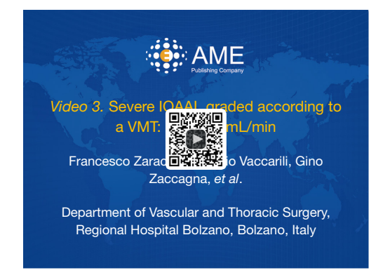
Figure 3 Severe IOAAL graded according to a VMT: leak 520 mL/min (10). IOAAL, intraoperative alveolar air leak; VMT, Ventilation Mechanical Test.

Available online: http://www.asvide.com/articles/1855