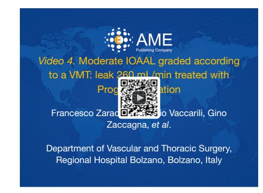
Figure 4 Moderate IOAAL graded according to a VMT: leak 260 mL/min treated with Progel application. Control after treatment (11). IOAAL, intraoperative alveolar air leak; VMT, Ventilation Mechanical Test.

Available online: http://www.asvide.com/articles/1856