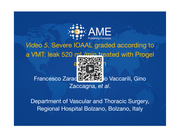
Figure 5 Severe IOAAL graded according to a VMT: leak 520 mL/min treated with Progel application. Control after treatment (12). IOAAL, intraoperative alveolar air leak; VMT, Ventilation Mechanical Test.

Available online: http://www.asvide.com/articles/1857