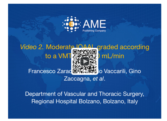
Figure 2 Moderate IOAAL graded according to a VMT: leak 180 mL/min (9). IOAAL, intraoperative alveolar air leak; VMT, Ventilation Mechanical Test.

Available online: http://www.asvide.com/articles/1854