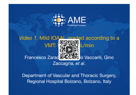
Figure 1 Mild IOAAL graded according to a VMT: leak 60 mL/min (8). IOAAL, intraoperative alveolar air leak; VMT, Ventilation Mechanical Test.

Available online: http://www.asvide.com/articles/1854