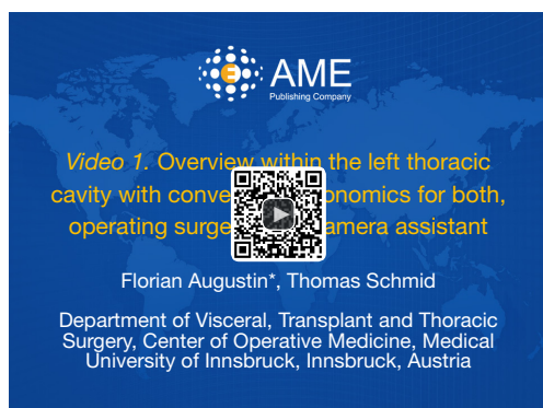
Figure 2 Overview within the left thoracic cavity with convenient ergonomics for both, operating surgeon and camera assistant (12). Available online: http://asvidett.amegroups.com/article/view/22809

When reading U-VATS case series, it is challenging to read “between the lines”. Phrases like “Although it is technically demanding, ...” or “...is a viable alternative approach to C-VATS in selected patients, especially in patients with early peripheral lung cancer with good anatomy and in good general condition” already point out some facts that should be considered (9,13). U-VATS seems to be more challenging than a C-VATS approach. With multiple instruments introduced via a single incision the procedure gets more complicated. Especially for surgeons, who were trained doing a C-VATS lobectomy, the change is not as easy as one might think. As Detterbeck and Molins put it, “user-friendliness trumps effectiveness: if a new technique is hard to perform or learn, adoption will be limited” (3). Liu et al. point out that learning U-VATS might even be easier for younger surgeons who have never been formally trained doing C-VATS anatomic resections (14).