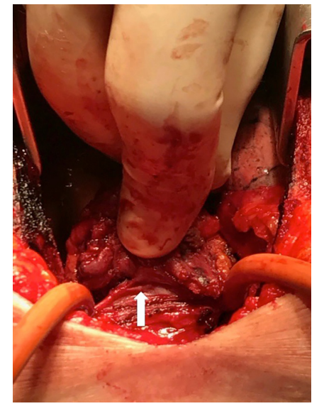
Figure 2 Trans-sternal approach: after the left innominate vein is encircled with umbilical tapes, tourniquets are placed proximally and distally. In this way surgical team is able to correctly identify the source of bleeding and assess the extent of vascular injury (white arrow).

Available online: http://asvidett.amegroups.com/article/view/22985