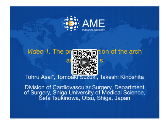
Figure 1 The proximalization of the arch anastomosis (1). Available online: http://www.asvide.com/article/view/24429

We perform open surgery for the total arch replacement with a view to these structural features. The location of the planned distal aortic anastomosis, beyond the aneurysmal portion, often appears very deep in the preoperative CT scan ( Figure 2A ). However, after skeletonizing the distal aortic stump, we can usually bring the distal aortic stump