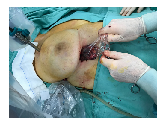
Figure 1 Extraction of the specimen protected by an endobag with enlargement of one of the port incisions.

In eight patients (88.9%), the procedure was completed by hybrid robotic surgery. In one case, the surgical equipe