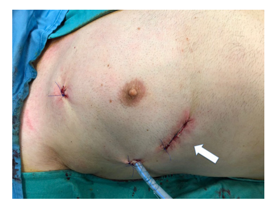
Figure 4 Extension of a port-site incision to pull out the specimen at the end of the procedure (white arrow).

vision, using robotic arms introduced through minimally invasive accesses, and followed by final extension of a port-site incision to retrieve the voluminous specimen ( Figure 4 ). This approach allows to perform delicate maneuvers of dissection within the incredibly narrow space of anterior mediastinum, using the technical advantages of robotic technology; at the same time, through the final extension of a port-site incision for large specimen retrieval, it is less painful than open thoracotomy.