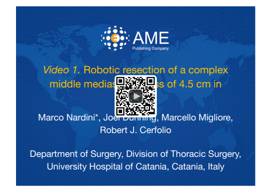
Figure 2 Robotic resection of a complex middle mediastinal mass of 4.5 cm in diameter (7). The robotic platform allowed a minimally invasive approach. The chest drain was removed on the following day, when the patient was discharged home.

Available online: http://www.asvide.com/article/view/24951