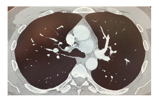
Figure 1 Chest computed tomography which shows the incidental mass in front of the carina, posterior to the ascending aorta and sitting over the pulmonary trunk's bifurcation.