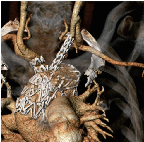
Figure 3 3D reconstruction from the postoperative CT scan after implantation of the DBP. DBP, double branched prosthesis.

TEVAR setting potentially due to the lack of tangential clamping of the ascending aorta (4,11). In addition, the knowledge that patients with the underlying pathology of type B aortic dissection also do have an inherently diseased ascending aorta has become accepted in the community and therefore these kinds of approaches are no longer offered to patients with this condition thereby reducing the incidence of retrograde type A aortic dissection. However, the endografts are custom made and time is needed for the manufacturing. Therefore, time per se excludes several patients from clinical implementation. Finally, there are no long-term results of the approach and the clinical experience is actually scarce.