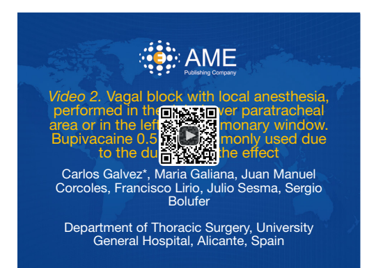
Figure 5 Vagal block with local anesthesia, performed in the right lower paratracheal area or in the left aortopulmonary window. Bupivacaine 0.5% is commonly used due to the duration of the effect (25).

Available online: http://www.asvide.com/article/view/25876