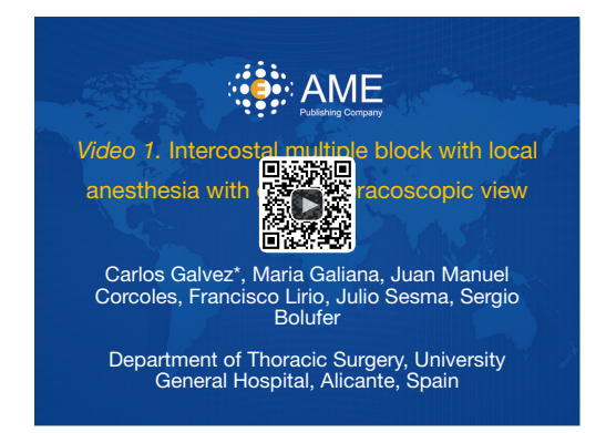
Figure 3 Intercostal multiple block with local anesthesia with direct thoracoscopic view (22).

Available online: http://www.asvide.com/article/view/25875