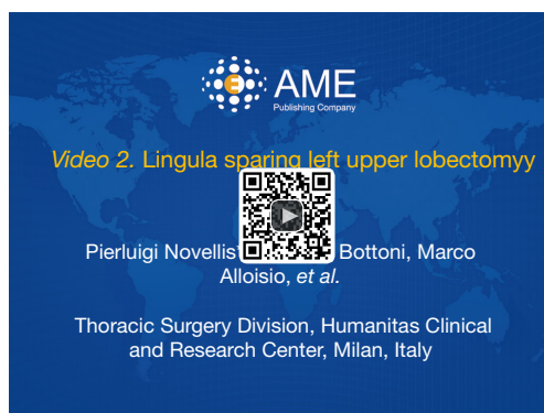
Figure 4 Lingula sparing left upper lobectomy (37). Available online: http://www.asvide.com/article/view/26353

the linear endostapler. Often after the bronchus has been divided, a posterior segmental pulmonary artery branch is found and is isolated, ligated, and divided between surgical clips or with the linear endostapler. Using lung insufflation or intravenous indocyanine green (ICG) administered by the anesthesiologist, the anteroapical bisegment is divided from the lingular segments of the left upper lobe and extracted from the chest within an endobag. Note that all endostaplers are introduced during this segmental operation through the port in line with the tip of the scapula. This operation ends after dissection of nodal stations 7, 8, and 9, which is performed posterior to the anteriorly retracted remaining right lung ( Figure 4 ).