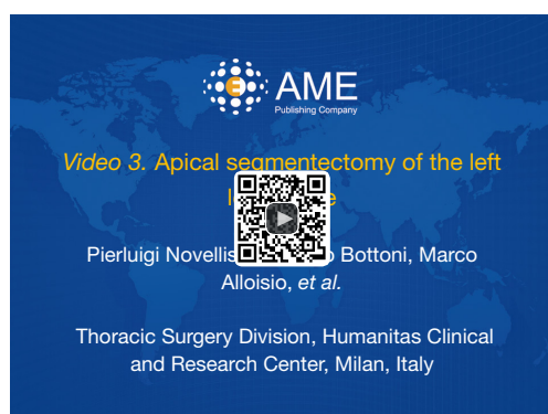
Figure 5 Apical segmentectomy of the left lower lobe (38). Available online: http://www.asvide.com/article/view/26354