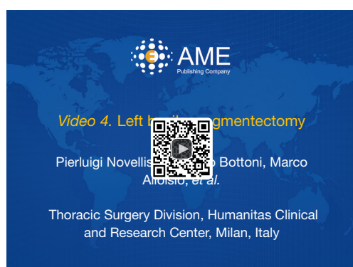
Figure 6 Left basilar segmentectomy (39). Available online: http://www.asvide.com/article/view/26355

the superior segmental pulmonary vein is introduced from the posterior port. The operation ends after the dissection of nodal stations 2 and 4 on the right and nodal stations 5 and 6 on the left ( Figure 5 ).