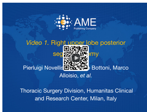
Figure 3 Right upper lobe posterior segmentectomy (36). Available online: http://www.asvide.com/article/view/26352