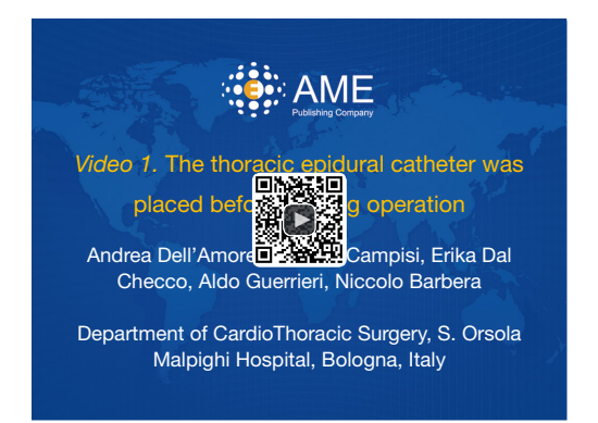
Figure 4 The thoracic epidural catheter was placed before starting operation (1).

Available online: http://www.asvide.com/article/view/27483