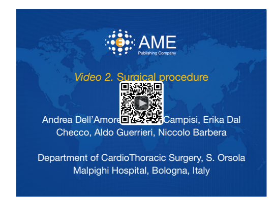
Figure 5 Surgical procedure (2). Available online: http://www.asvide.com/article/view/27484

Available online: http://www.asvide.com/article/view/27483