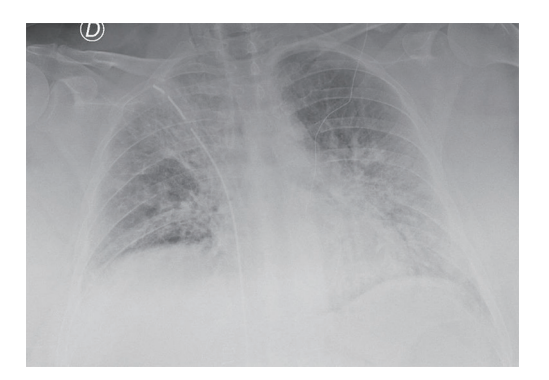
Figure 3 Post-operative chest X-ray.