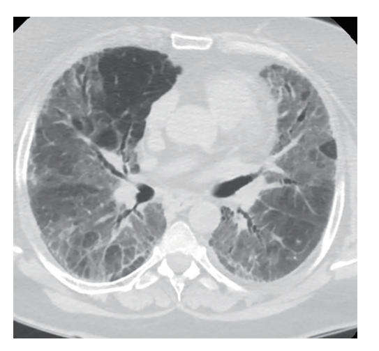
Figure 1 Preoperative high-resolution computed tomography scan of the chest.

With the patient in sitting position, the thoracic epidural was placed in the T6–T7 space, with the ultrasound-assisted