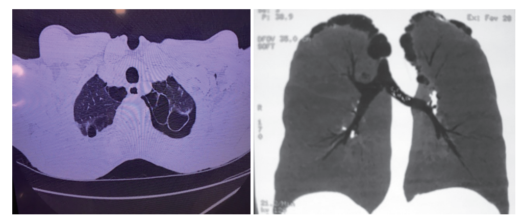
Figure 1 Tomography showing small blebs of bilateral apical subpleural emphysema.

detected, relapse rate increased to 82%. On the other hand, in patients without bleb/blister tomography findings, the recurrence rate was 6.1%, with a negative predictive value of 93.9%. The risk of contralateral recurrence was 19% in patients with positive radiological findings and absent in those whit no contralateral alterations. In a multivariate analysis that included sex, age, body mass, smoking and pneumothorax, only the presence of blebs/ blisters was significant for the risk of relapse (P<0.001) and 18 as odds ratio.