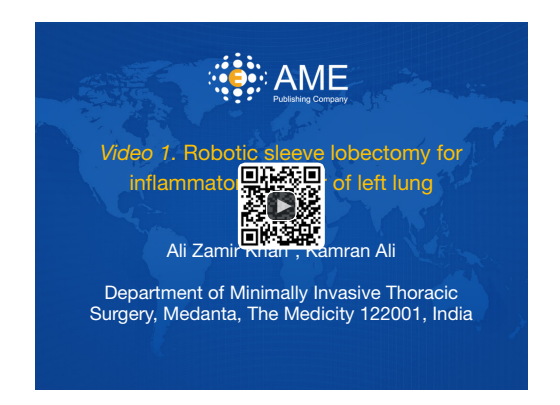
Figure 2 Robotic sleeve lobectomy for inflammatory tumour of left lung (1).

Available online: http://www.asvide.com/article/view/30914