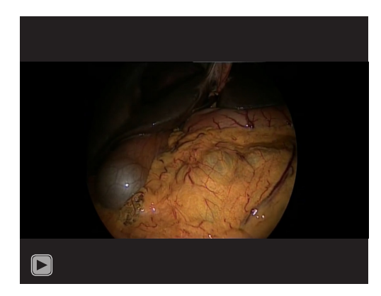
Video 1 Three trocars laparoscopic Whipple (11).