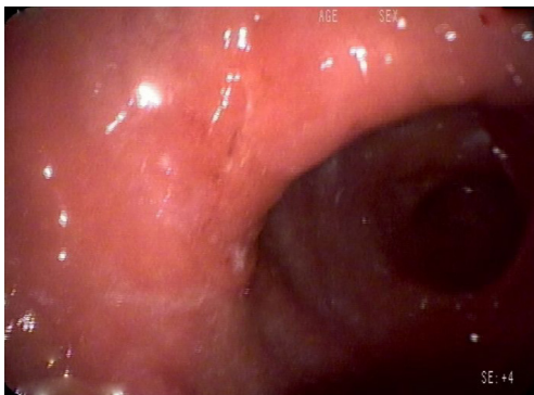
Figure 2 Gastroscopy.

Available online: http://www.asvide.com/articles/752