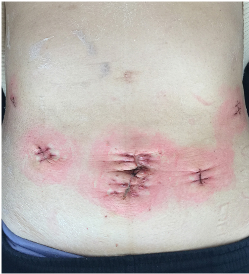
Figure 5 Surgical incision.