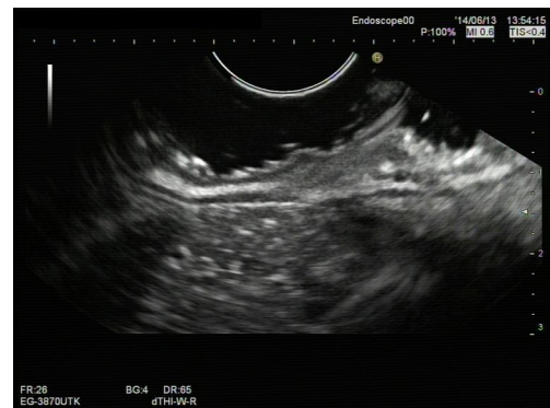
Figure 4 Endoscopic ultrasonography.