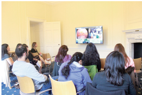
Figure 9 Another room for the symposium.