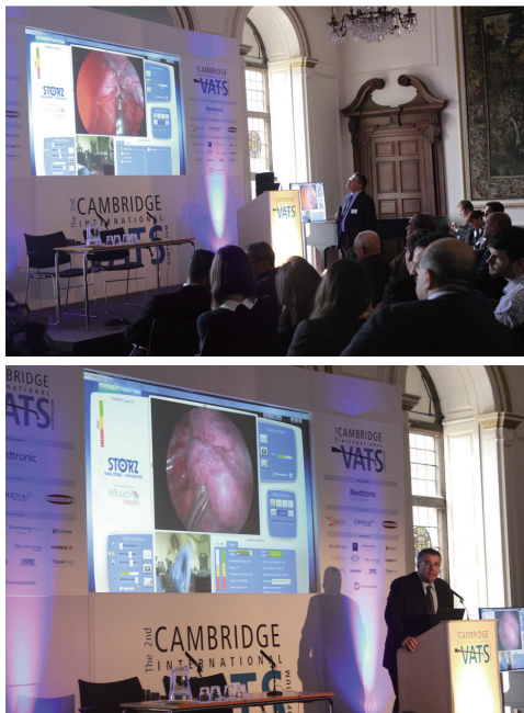
Figure 8 Symposium main room during the live surgery.