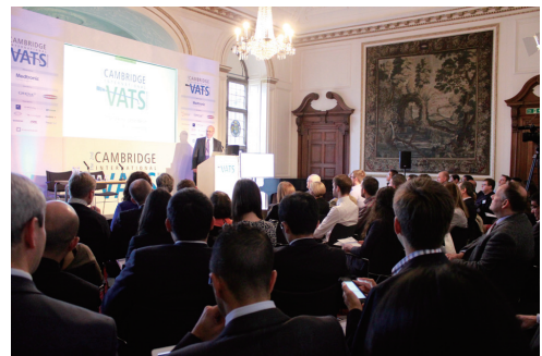
Figure 2 Fully occupied meeting room.

experts from different countries to continue their question & answer during the meeting.