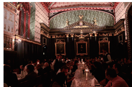
Figure 7 Dinner in Queen’s College.