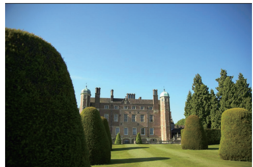
Figure 1 Madingley Hall.

After the whole day's speeches, Dr. Scarci invited all the experts to have a special dinner in Queen's College ( Figure 7 ). Not just to relax, the dinner also provided a great chance for