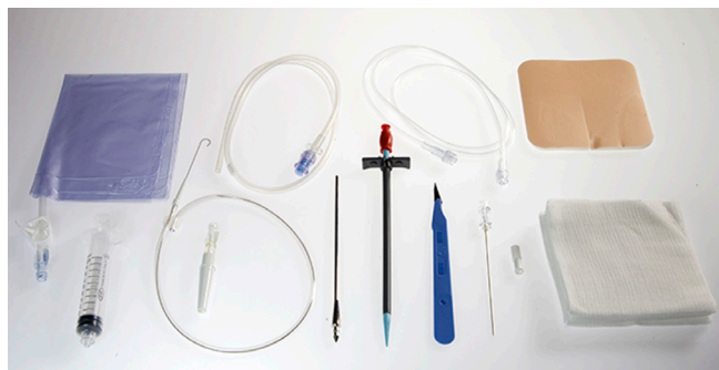
Figure 2 Indwelling pleural catheter set. The indwelling pleural catheter set contains a 65-cm 15.5-Fr fenestrated silicone catheter, a safety scalpel, a guide wire introducer with needle, a 10-mL luer lock male Syringe, a 60-cm J-tip guide wire, a valve 16-Fr peel-away introducer, a metal tool for tunnelling, a needle foam stop, and a catheter insertion stylet.

Figure 1 Indwelling pleural catheter. The indwelling pleural catheter is made of silicone and is 65 cm in length and 15.5 Fr in diameter. The distal end of the catheter has several side holes and is placed within the peritoneal cavity. There is a polyester cuff midway along the catheter which is sited 1–2 cm within the subcutaneous tunnel and helps to secure the catheter in place by encouraging tissue ingrowths. The initial subcutaneous course of the catheter reduces the risk of subsequent infection and the leakage of pleural fluid.