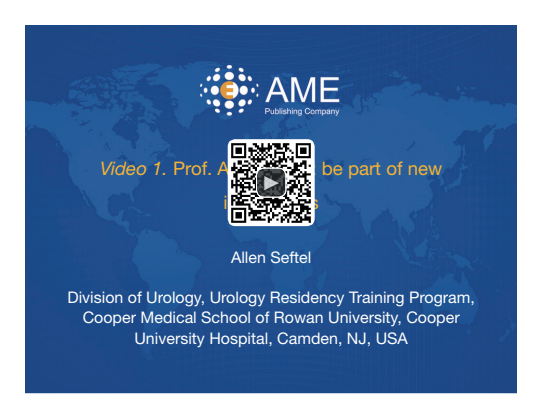
Figure 2 Prof. Allen Seftel: be part of new innovations (1). Available online: http://www.asvide.com/articles/1070