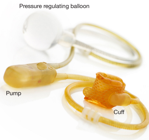
Figure 1 AMS 800™ artificial urinary sphincter.

urethral cuff and a stress release balloon, which is placed extra-peritoneally and has the ability to adapt to changes in the intra-abdominal pressure. This system also allows for pressure adjustment postoperatively without the need for a new surgery, like the Zephyr ZSI 375. The first implantation of the FlowSecure™ in the bladder neck of a female SUI patient with spina bifida showed successful results (44,45).