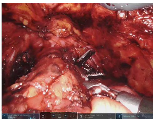
Figure 2 Robot-assisted AUS implantation in a female patient. Dissection of the posterior aspect of the bladder neck. AUS, artificial urinary sphincter.