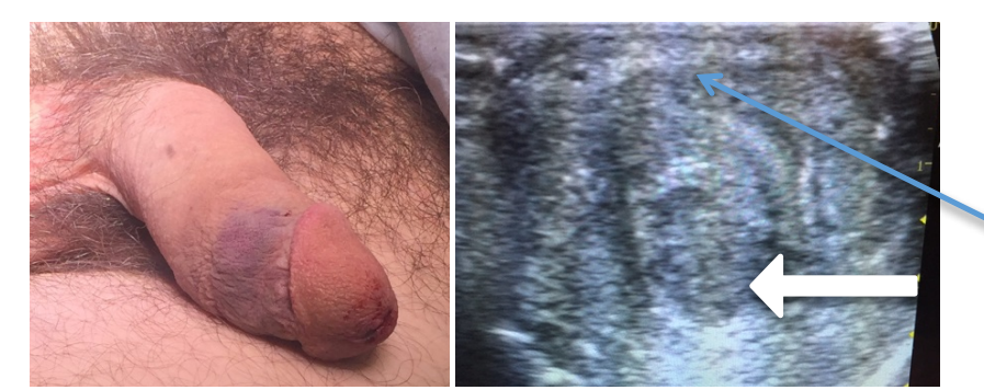
Tunica albuginea (blue arrow). Intracavernosal hematoma (white arrow).

In many cases of suspected penile fracture, a clearly disrupted TA is not well visualized. This is likely because rupture exposes the collagen of the TA to blood, and the exposed collagen is one of the most powerful initiators of blood clotting in vivo. This exposure activates the clotting cascade and allows for rapid thrombosis, effectively sealing the TA and making a tunical tear difficult to visualize. In such cases, though, this same clotting cascade leads to the development of an intracavernosal hematoma, seen on US as a circular or irregular hypoechoic region surrounded by echo-dense corporal tissue (Figures 3-5). Figure 3 depicts a 27-year-old male with self-inflicted penile trauma. This patient had an atypical presentation without the usual associated historical features such as a "pop", pain, or loss of erection. Bedside US of the penis showed subcutaneous hematoma, clear disruption of the TA border, and the intracorporal "Turkish eye sign" with irregularity of the normally homogenous corporal tissue. Penile exploration