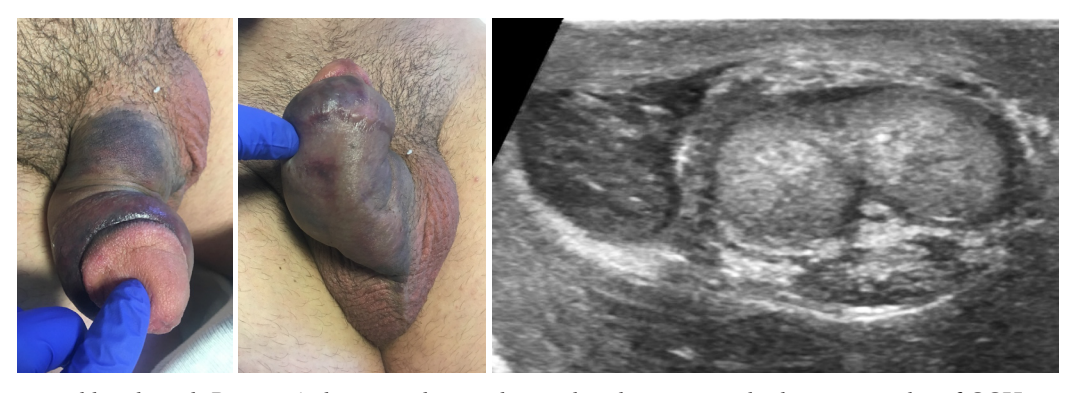
Figure 1 A 52-year-old-male with Peyronie's disease with a 90-degree dorsal curvature who have two cycles of CCH separated by three months. The patient had mild, transient penile ecchymosis after his first injection. During his first attempt at intercourse 2 weeks after his 2^{nd} injection, he felt a "pop", lost his erection, and noted a quickly expanding hematoma around his penis. He had no associated hematuria.