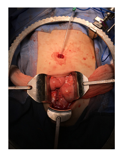
Figure 2 Pfannenstiel incision with rosebud channel stoma.

akin to a double Monti ( Figure 1 ). This preserves the original continence mechanism. When the entire channel is compromised then one must resect it and create an entirely new channel.