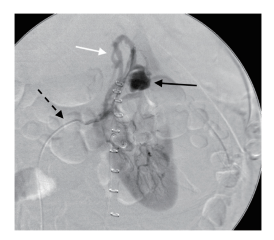
Figure 3 Renal pseudoaneurysm and arteriovenous fistula (AVF). Selective left renal angiogram demonstrates catheter in the left renal artery (dashed arrow). Superior pole renal pseudoaneurysm is present (black arrow) with early draining vein (white arrow) indicating that AVF is also present. Renal pseudoaneurysms often occur together with AVF. This was treated with coil embolization.

respond—to resuscitation require immediate intervention (Grade B evidence strength) (6). According to Brever et al., indications for surgery over AE techniques in hemodynamically unstable patients include grade V renal injury, avulsion of the renal pelvis, and damage to the main renal artery and vein (though renal artery stent is another option for this indication) (7).