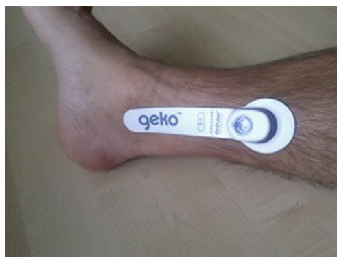
Figure 1 The geko™ device applied over the ankle behind the medial malleolus.

Non-invasive alternatives, whereby the tibial nerve is stimulated transcutaneously (TTNS) at a home-based setting, have therefore been explored (7). Early results have been promising, demonstrating improvements in OAB symptom scores and urodynamic parameters (7,8). So far, these studies have been using a TENS (transcutaneous electrical nerve stimulation) machine for stimulating the tibial nerve at frequencies between 10 to 40 Hz, which can be administered by the patient at home using pre-determined stimulation settings (9). Using a TENS machine however restricts the mobility of patients during the time that the nerve is being stimulated. Recently, a self-applicating skin-adhering ambulatory device, known as geko™ (Firstkind Limited, Buckinghamshire, UK) ( Figure 1 ) has been developed and has received a CE mark for the prevention of deep vein thrombosis through chronic popliteal fossa stimulation, with no reported safety concerns (10). This device has recently been piloted in a study exploring outcomes in a cohort of patients reporting faecal incontinence, with promising results (11). Whether