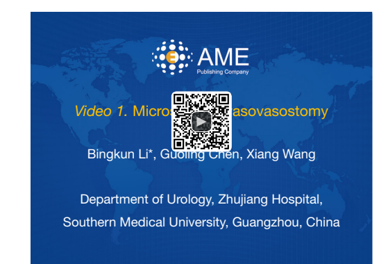
Figure 1 Microsurgical vasovasostomy (1). Available online: http://www.asvide.com/articles/208