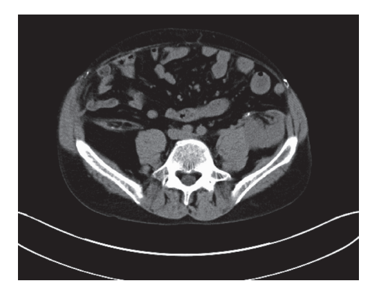
Figure 2 Left lower quadrant renal transplant with proximal ureteral stone.

Choate et al. Urologic complications in renal transplants