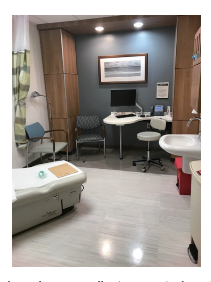
Figure 1 It shows the semen collection room in the male infertility clinic. The room contains chairs and a desk (for initial intake information), an exam bed and a sink. A specimen cup and a magazine (in a brown envelope) have been placed on the exam bed.