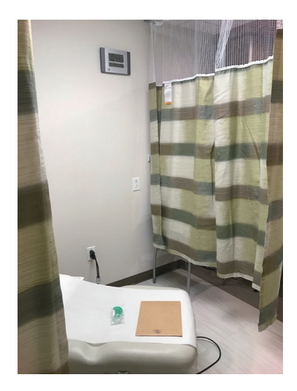
Figure 2 It shows the semen collection room with the curtains partially closed. The patient could opt to close the curtains if he wished to increase his sense of privacy during collection.