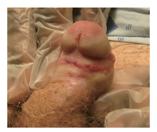
Figure 1 Lichen sclerosus related stricture disease.