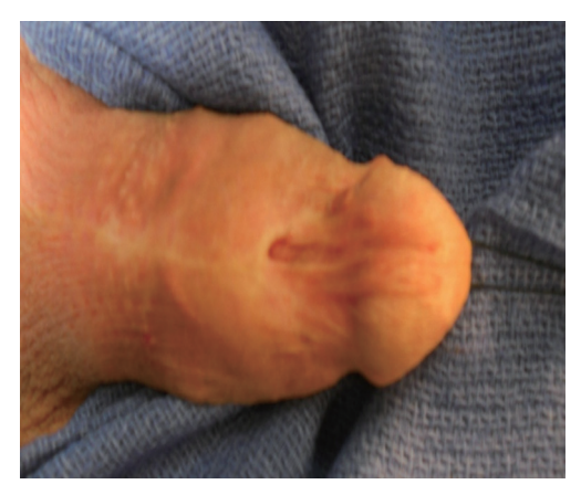
Figure 2 Hypospadias failure.

Urethral involvement can range from isolated meatal stenosis to obliterative stricture disease, which can encompass the entire anterior urethra. The cause of lichen sclerosus remains unknown, although infectious, autoimmune and genetic etiologies have been postulated and continue to be explored.