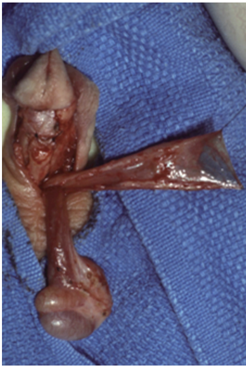
Figure 3 (Courtesy of Snow, B): example of harvested tunica vaginalis flap. The testicle is separated from the tunic vaginalis and there is a generous amount of tissue available for coverage of the phallus.

unobstructed voiding and resolution of urethral pain, urinary tract infections, or hematuria do not want to risk the complications associated with closure of the 1 st stage urethroplasty. Another reason that some men do not undergo closure is that they have graft contracture and are facing additional buccal graft revision of the urethral plate and they decide additional surgery is not worth the morbidity, considering that they are voiding without difficulty.