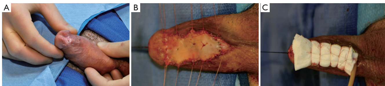
Figure 2 Coronal margin meatus (A) with stricture requiring excision of the scarred urethra followed by buccal graft onlay and quilting (B). Example of bolster dressing (C).

as this would open to 0.8-1.2 cm in width. If the urethral plate is preserved then the buccal mucosa graft can be split around it with excision of the most distal portion, which is usually the most stenotic segment. This arrangement is like a pair of pants with the seat of the pants oriented at the future meatus and glans. Alternatively, the urethral plate can be split ventrally and dorsally, with placement of the graft dorsally between the two laterally split portions of the urethra. The potential advantage of this approach is that the urethra takes well to the corporal bodies and does not need to be mobilized in a second stage closure.