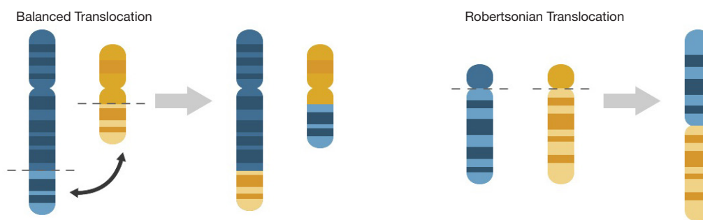
Figure 2 Various translocations of chromosomes. Citation: yourgenome, Genome Research Limited.

material. These can be balanced or unbalanced translocations depending on even or uneven shifting of material ( Figure 2 ). Balanced translocations essentially switch material between chromosomes without any loss or gain of genes and therefore causes no negative imprint or phenotype for the affected individual. These occur in about 1 in 500 births (39). Though typically healthy, these carriers have a higher risk of creating unbalanced translocations in their gametes, which would then be passed on to their child. In an unbalanced translocation, genetic information is exchanged unevenly such that there are either extra or missing genes. A less common exchange is non-reciprocal, in which material from 1 chromosome moves to another, but no material comes back to the first.