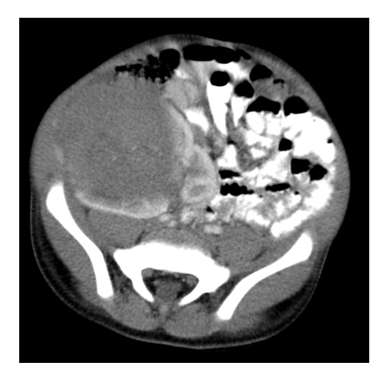
Figure 1 Axial CT image from a patient with Wilms tumor showing the characteristic "claw sign" seen in tumors of renal origin, in which the enhancing renal parenchyma is displaced by the enlarging tumor. CT, computed tomography.

and is the most common kidney neoplasm in the first 3 months of life (3). In the second decade of life, renal cell carcinoma is the most common primary tumor of the kidney (4). Other clues that guide the differential diagnosis include the presence of a known genetic predisposition such as Beckwith-Wiedemann syndrome, or evidence of genitourinary anomalies or other features that may suggest other syndromes seen with Wilms tumor (5). For older children, there is a known association between tuberous sclerosis and angiomyolipoma, as well as von-Hippel-Lindau disease and renal cell carcinoma. Finally, renal involvement does not always mean a primary renal tumor, as some teenagers with lymphoma may have marked kidney involvement.