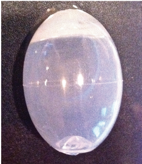
Figure 1 Saline-filled testis prosthesis showing self-sealing fill port (superior) and suture fixation tab (inferior).

The scores on 2 of 3 validated, psychological quality of life instruments were stable or improved significantly (e.g., the Body Esteem Scale, and the Body Exposure in Sexual Activities Questionnaire) after the prosthesis was