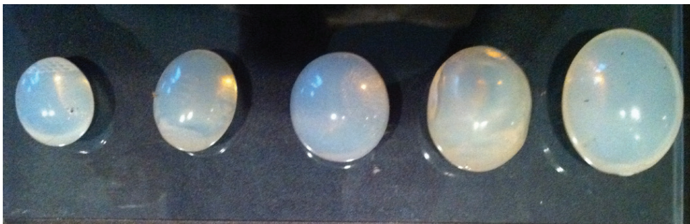
Figure 2 Soft-solid testis prostheses.

In this multi-center prospective controlled study done at 10 investigating centers over a 1 year period, a new silicone gel-filled testis prosthesis ( Figure 2 ) was evaluated to determine the safety and effectiveness of the device. Safety was assessed by collection of all adverse device placement related events, also comparing these with the data from the previous saline-filled prosthesis study. Efficacy was measured using the Patient Assessment Questionnaire, a previously validated quality of life instrument. Of the 55 patients assessed at 1 year (20 children), the adverse event rate was 2.7%. One patient was explanted because of