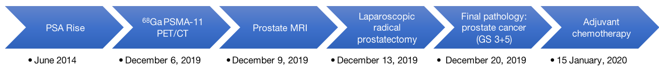
Figure 3 Timeline of examination and treatment.

the pathology of the patient, and the image did not show systemic metastasis at the same time. The postoperative pathology showed high-risk prostate cancer, so it was necessary to receive endocrine therapy and monitor PSA levels.