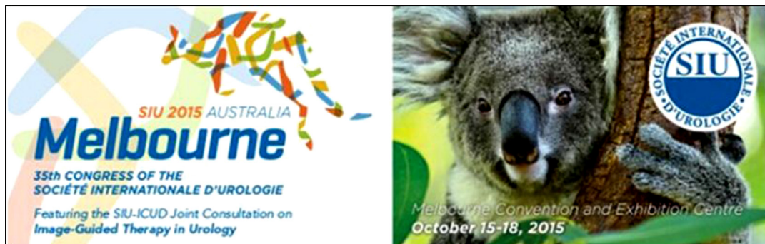
Figure 3 Logo of Société Internationale d'Urologie (SIU) 2015, 35th Congress of the Société Internationale d'Urologie.