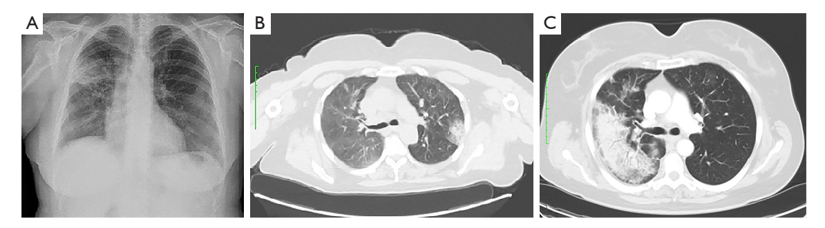
Figure 1 Chest X-ray and computed tomography. (A) Posteroanterior chest X-ray shows multiple opacities in the lung fields bilaterally; (B,C) chest CT with intravenous contrast: evidence of consolidations in different segments of both lungs. Thin subpleural sparing is also visible.