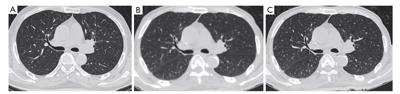
Figure 3 Axial images of a 64-year-old male after resection and chemotherapy of gastric cancer (body mass index, 21.3 kg/m²). The first scans with routine dose and FBP reconstruction (A), with the subjective scores of 5, 5, 5, 5 in artifacts, noise, visualization of small structures, and confidence of targeted lesions, respectively. The second scans with low dose and FBP reconstruction (B), with the subject scores of 3, 3, 4. Low photon penetration due to low dose was observed as blurred edges and higher noise/artifacts. The second scans with low dose and IMR reconstruction (C), with the subjective scores of all indices. FBP, filtered back projection; IMR, iterative model reconstruction.