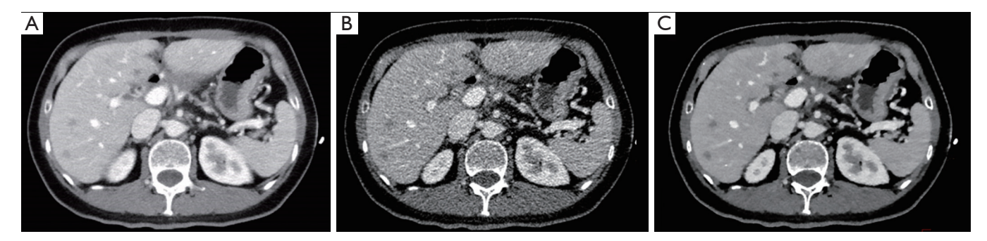
Figure 2 Axial images of a 51-year-old female after resection and chemotherapy of gastric cancer (body mass index, 20.7 kg/m²). The first scans with routine dose and FBP reconstruction (A), with the subjective scores of 4, 5, 5, 5 in artifacts, noise, visualization of small structures, and confidence of targeted lesions, respectively. The second scans with low dose and FBP reconstruction (B), with significant image noise and fail to reach diagnostic acceptable image quality in visualization of small structures. The second scans with low dose and IMR reconstruction (C), with the subjective scores of 4, 5, 5, 5. FBP, filtered back projection; IMR, iterative model reconstruction.