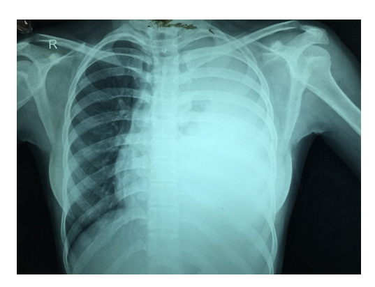
Figure 1 Chest radiograph (P-A view) showing left sided pleural effusion.

revealed no abnormal findings. On systemic examination the dull note was found on the left hemi thorax and vocal repercussion were decreased, auscultation reveled decreased breath sounds on the left hemi thorax. There were no signs of lower extremity deep-venous thrombosis and no palpable lymph nodes. The rest of the systemic examination was within the normal limits.