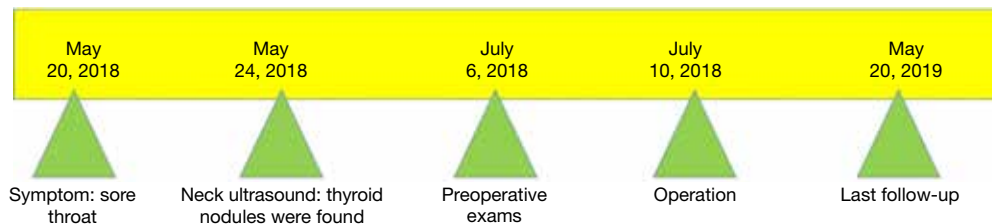
Figure 3 The timeline of the patient's historical and current information of care.

corpuscle is the marker of ectopic thymic tissue. In addition, the timeline of this patient's historical and current information was made as Figure 3 .