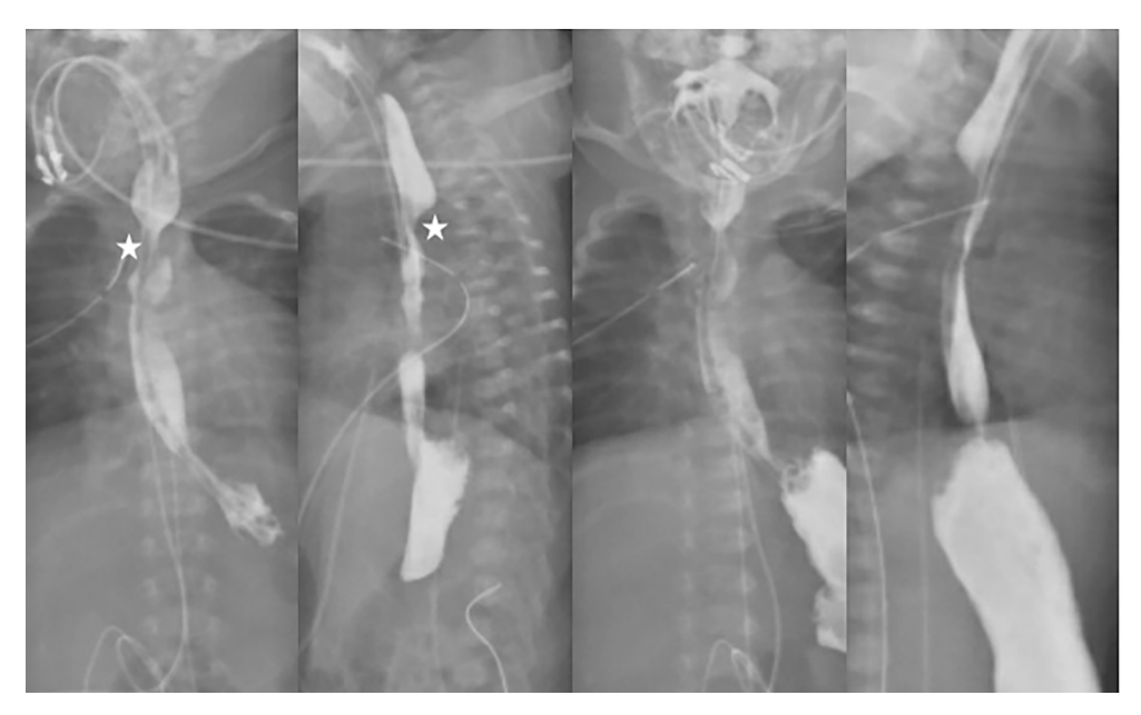
Figure 2 Contrast esophagography following esophageal atresia repair. Single-contrast esophagography under fluoroscopic guidance after tracheoesophageal fistula repair showed no anastomotic leak, as well as marked narrowing of the upper esophagus secondary to the vascular ring (asterisk).