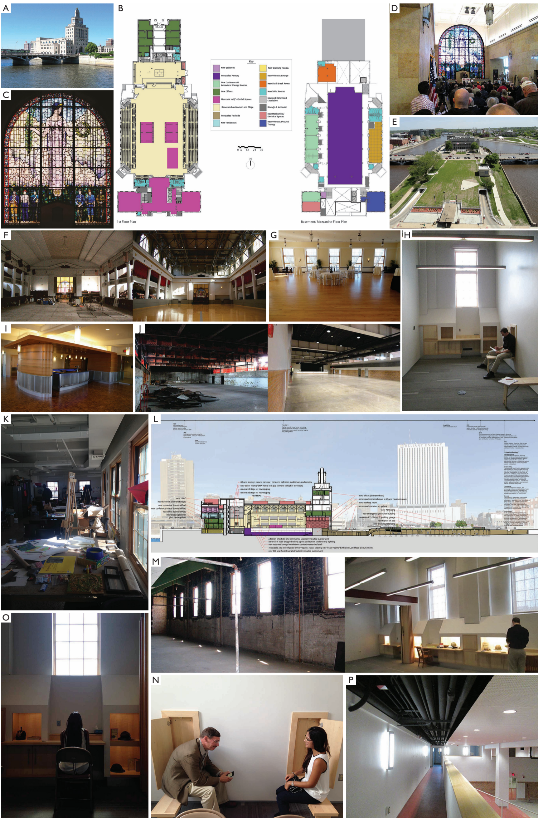
Figure S1 The Veterans Memorial Building located in Cedar Rapids, Iowa. (A) Image of the Veterans Memorial Building located on Mays Island located in Cedar Rapids, Iowa; (B) images of the architectural plans for the ground floor and mezzanine levels for the transformation of the Veterans Memorial Building located in Cedar Rapids, Iowa; (C) image Grant Wood's Memorial Window (installed in 1928) within the Memorial Room of the Veteran Memorial Building located in Cedar Rapids, Iowa; (D) image of the rebirth ceremonies in the Memorial Room in April 2014 of the Veterans Memorial Building located in Cedar Rapids, Iowa; (E) image taken from Veterans Memorial Building of the newly redesigned public green located in Cedar Rapids, Iowa; (F) images of the auditorium after the flood event and after the restoration within the Veterans Memorial Building located in Cedar Rapids, Iowa; (G) image of the restored ballroom that faces on the Cedar River of the Veterans Memorial Building located in Cedar Rapids, Iowa; (H) image of the small conference room with writing kiosk, display cases, and two fold down benches for behavioral therapy of the Veterans Memorial Building located in Cedar Rapids, Iowa; (I) image of the café/bar allowing Veteran peer mentoring at the Veterans Memorial Building located in Cedar Rapids, Iowa; (J) images of the armory/multi-purpose space after the flood event and after transformation of the space of the Veterans Memorial Building located in Cedar Rapids, Iowa; (K) image of the new Veteran art studio located on the 7th floor of the Veterans Memorial Building located in Cedar Rapids, Iowa; (L) image of the architectural building section encompassing the entire scope of the project consisting of the building, underground parking and public green of the Veterans Memorial Building located in Cedar Rapids, Iowa; (M) images of meeting rooms after the flood event and the new conference center utilized for Veteran writer workshops in the Veterans Memorial Building located in Cedar Rapids, Iowa; (N) image of the two fold down benches located in the small conference rooms within the Veterans Memorial Building. Cedar Rapids, Iowa. They are (left to right) Mike Jager, the Executive Director of the Veteran Memorial Building and Carolina Almeida of AA + RA; (O) image of writing kiosks located in the small conference rooms and conference center in the Veterans Memorial Building located in Cedar Rapids, Iowa; (P) image of the open corridor along the southern edge of the armory/multi-purpose space in the Veterans Memorial Building located in Cedar Rapids, Iowa.