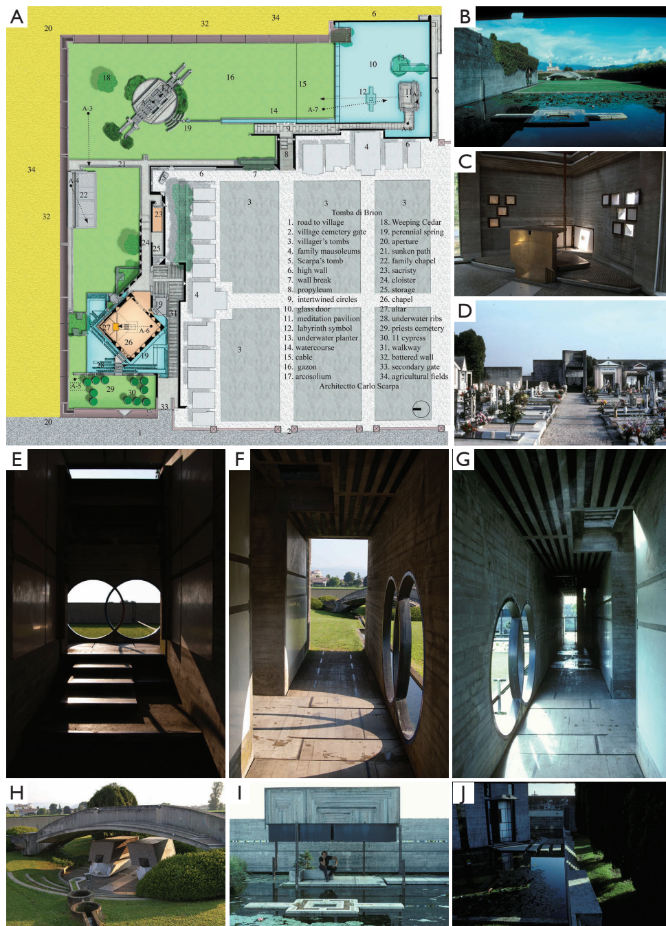
Figure 4 The Brion Tomb located near San Vito d' Altivole, Italy. (A) Architectural plan of the Brion Tomb located near San Vito d' Altivole, Italy; (B) image from the meditative pavilion within the Brion Tomb located near San Vito d' Altivole, Italy; (C) image of the altar within the chapel of the Brion Tomb located near San Vito d' Altivole, Italy; (D) image of the propyleum of the Brion Tomb located near San Vito d' Altivole, Italy; (E) image of the interior of the propyleum of the Brion Tomb located near San Vito d' Altivole, Italy; (F) image of the interior of the portico of the Brion Tomb located near San Vito d' Altivole, Italy; (G) image of the interior of the portico looking towards the glass door leading to the meditation pavilion of the Brion Tomb located near San Vito d' Altivole, Italy; (H) image of the arcossolium containing the tombs of Giuseppe and Onorina Brion located near San Vito d' Altivole, Italy; (I) this is an image of the meditation pavilion surrounded by a lily pool of the Brion Tomb located near San Vito d' Altivole, Italy; (J) this is an image of the chapel, reflecting pool and priests' cemetery of the Brion Tomb located near San Vito d' Altivole, Italy.