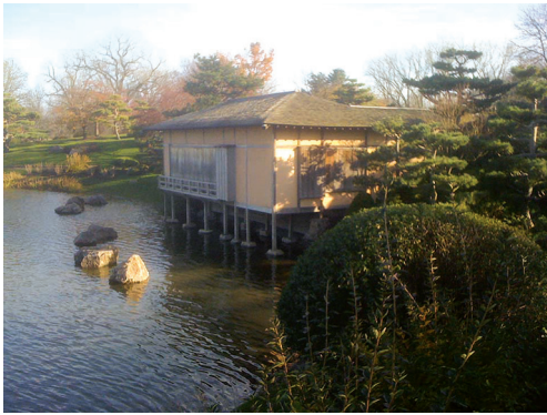
Figure 1 This image is a Japanese tea garden pavilion at the Chicago Botanic Gardens.

way communication, physician centric, clinical model driven by business model” (3).