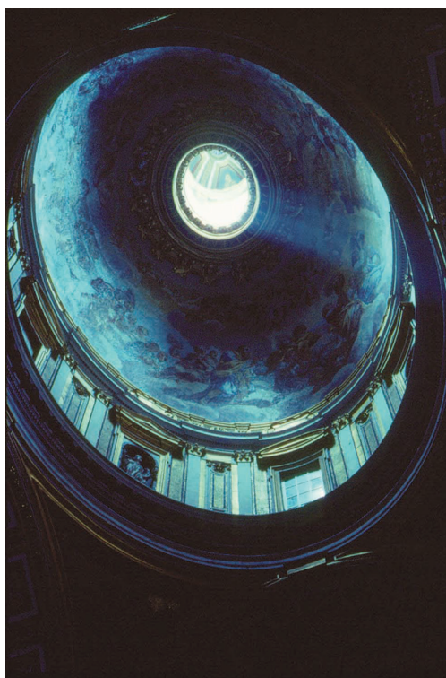
Figure 2 Image of the interior of the dome of the Church of Gesu located in Rome, Italy.

working in unison with CAM have not. These medical facilities could take a cue from the ancient, international healing city of Epidaurus, located about 50 km northwest of modern Athens and settled in the late Bronze Age.