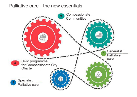
Figure 1 Palliative care—the new essentials.

The New Essentials model proposes a way of integrating