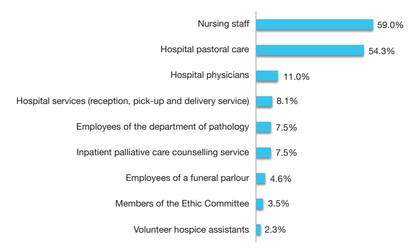
Figure 2 Professions responsible for bereavement rooms (N=173).

well-established inpatient palliative care service were more likely to participate in our study than hospitals without this special medical support. Perhaps the term "bereavement room" had not been defined clearly enough. We defined a bereavement room as a specially designed morgue in the hospital in which family members, friends and acquaintances bid farewell to a deceased patient in a private and dignified atmosphere. In this context, it would be conceivable that study participants might have misinterpreted a regular ward room as a bereavement room. In clinical practice, a ward room in which the patient has died is often temporarily redesigned by nursing staff so that relatives can say goodbye to their loved one in a private atmosphere. After this ceremony, this room is used as a regular ward room again.